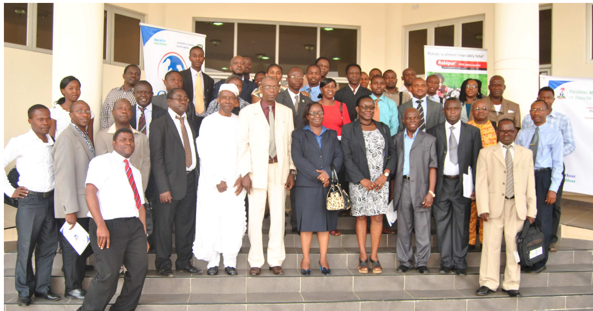
Group Photograph on Day 1 after the Opening Session of the 1st International Congress on Rabies in West Africa (RIWA) and Related Curriculum Review Workshop to Improve Postgraduate Programmes for Surveillance of Human-Animal Diseases in West Africa, held at University of Ibadan, 4-7 December, 2012