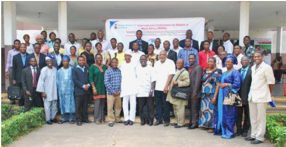
Group Photograph at the Closing Session of the 1st International Congress on Rabies in West Africa (RIWA) and Related Curriculum Review Workshop to Improve Postgraduate Programmes for Surveillance of Human-Animal Diseases in West Africa, 4-7 December, 2012